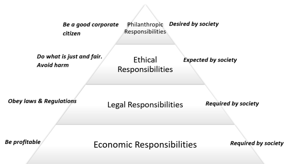
Figure 1. The CSR Pyramid.

As per A. Carroll, the economic dimension lies at the base of the pyramid, and therefore, it predicates all other dimensions. To be productive and profitable, to be able to meet the consumption need of the market (society), and to fill the expectations of providing a return on investment are the organization's goals. It forms the base from which all other organizational roles or commitments derive. Within the legal dimension is the law—the moral and ethical values of a society in a codified form, the indicator of right and wrong for its members. In that sense, within an organization's economic mission is the commitment to uphold legal standards, to conform to the standards, and comply with the legislation issued by the public bodies [25]. Within the ethical dimension lies a further commitment to society's moral values, to do the right thing even when a situation or behavior is not particularly legally regulated. In that sense, this dimension considers values and principles defined, upheld, and cherished as acceptable or desired by society [25]. Finally, the philanthropic dimension represents all the actions taken by an organization to