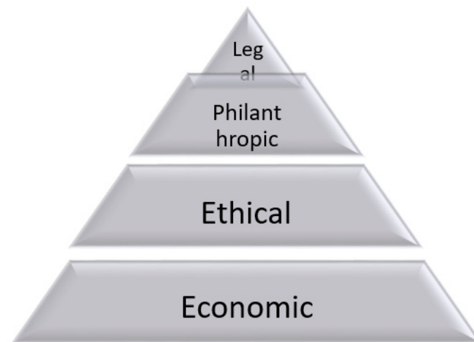
Figure 2. CSR pyramid layout for the group of Polish students.